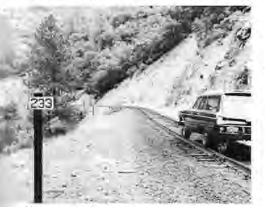
Milepost 233: First milepost sign one mile east after leaving new main line.

Earl Hurst, retired locomotive engineer, Manteca, September 5.