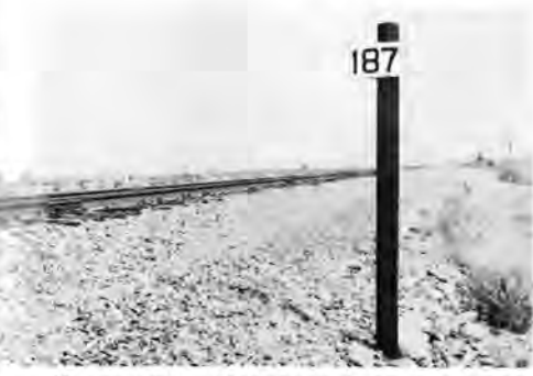
Milepost 187. High speed trains roll by here about 18 miles south of WP's Oroville yard.