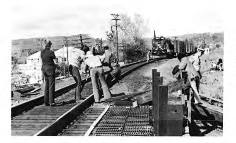
Cameras roll as "O. J." races across tracks ahead of WP freight.