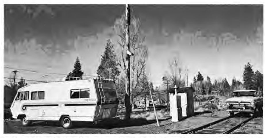
This portable 'open road' camper provided most of the comforts of a modern office for the temporary station operators on duty for a few days at Westwood, California. A WP "Hi-Railer," the type used for regular track inspection, is on the main line.