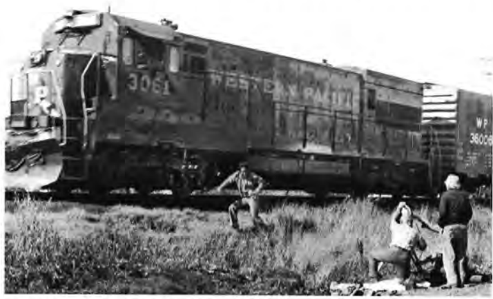
Two cameras are used to record this action shot . . . one from a short distance down the track and a second 'close up' camera near track side.

At the end of this scene "O. J." stops beyond the tracks and raises a gun ir defiance to the crowd that brought chase With just 'one take' the director calls "Cut" . . . "And Print It." For the before and after see "The Klansman."