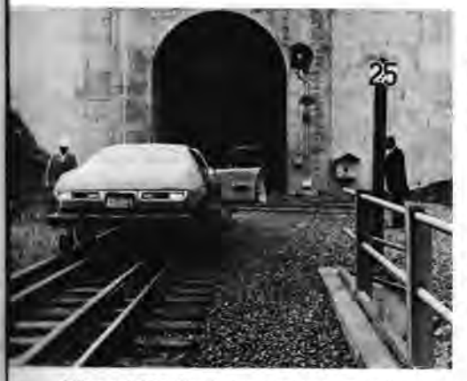
Milepost 231: Track inspection party will pass Milepost 231 inside 8856' Tunnel 8 (longest on railroad) after just crossing 66' Dark Canyon bridge (shortest on relocated main line). Speed limit sign at right.