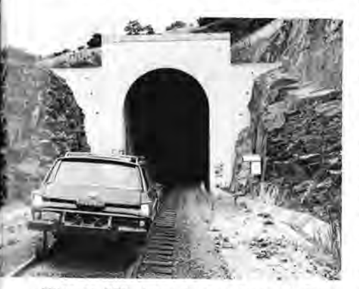
Milepost 225: Inspection party in Hy-Railer will pass Milepost sign inside 2,410'-long Tunnel 4. Station James one mile beyond.