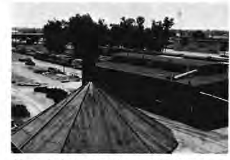
Above, looking railroad west, and above at right looking railroad east, as the old mill and car shed looked before being torn down.