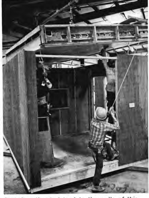
A roof section is joined to the walls of this Boise Cascade housing module at Meridian.

Above, Leo Delventhal, Boise Cascade's Clem Brantl, and Dave Copenhagen were highly pleased when inspection of first regular shipment verified that the loading method used provided the same damage-free protection as it did in the November test shipment.