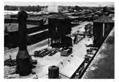
Below, left and right, as the area looks today in pictures taken from identical locations as those shown in pictures above.