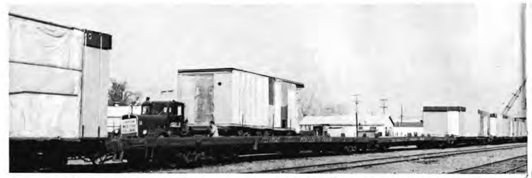
How market development brings new business to WP

A Boise Cascade module on truck enroute to GREENFAIR passes partially unloaded train. Crane at far right is ready for next lift to truck from train on spot at Sacramento.