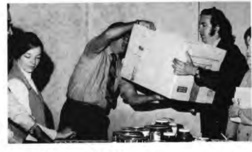
Left: "Did you say $12.45?"