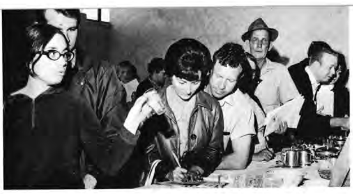
"Do you have these glasses in any other size?"