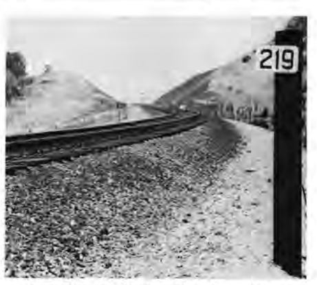
Milepost 219: Main line will soon pass long siding at Elsey station a mile beyond.