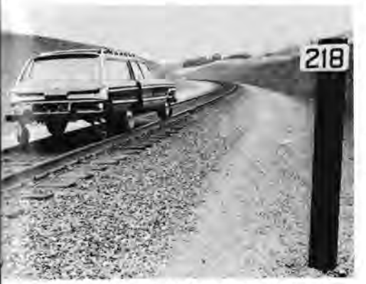
Milepost 218: A Hy-Railer inspection party about two miles west of Elsev siding.