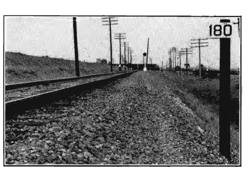
*Milepost No. 180: In distance an SP train crosses Western Pacific's main line at Binney Jct., a WP-SP interchange near Marysville.