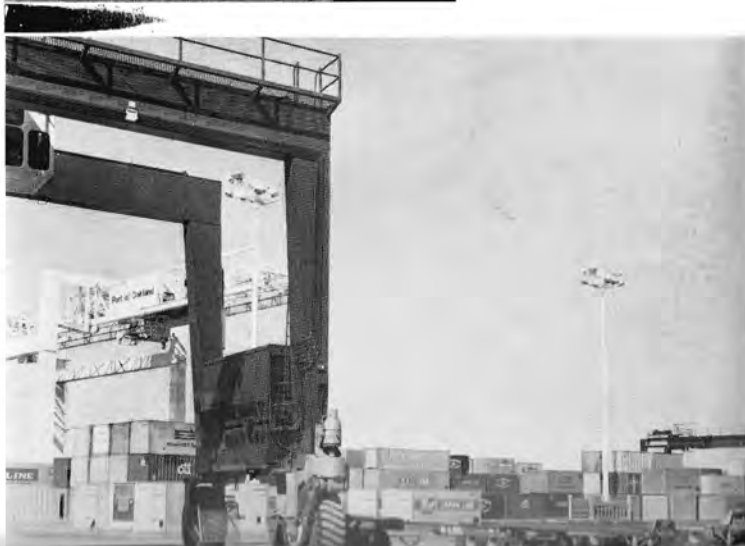
Behind a section of Port of Oakland's huge mobile crane are stacked containers of varied steamship lines just arrived from overseas. Containers will be placed aboard rail flat cars for shipment across country.