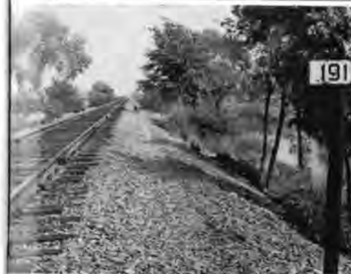
Milepost No. 191: Near the Yuba-Butte county line about 14 miles south of Oroville.