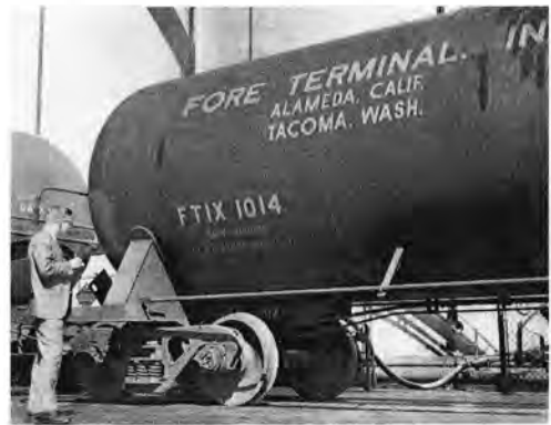
While passing by Fore Terminal Company plant in Alameda, Friedman stops to make note of tank cars on spot for loading.