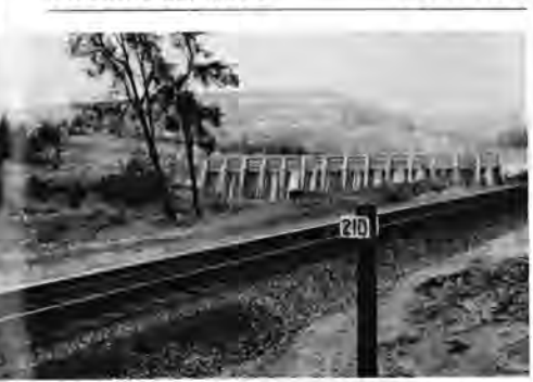
Milepost 210: After passing Thermalito diversion dam behind sign, main line first crosses Feather River over Feather River Bridge.

WESTERN PACIFIC MILEPOSTS 526 Mission Street San Francisco, CA 94105 Lee Sherwood, Editor