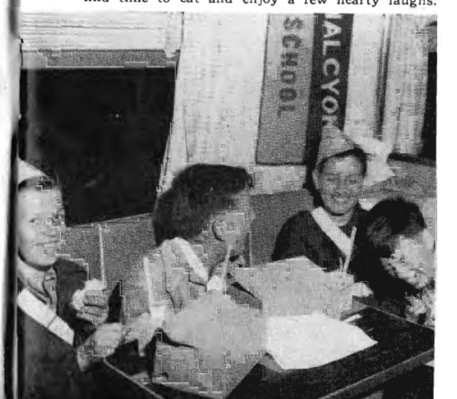
SCHOOL SAFETY AWARD OUTSTANDING MEMBERS Same of Process of Same Adametic County Histor for theorem shows

No matter what the occasion, teen-agers always find time to eat and enjoy a few hearty laughs.