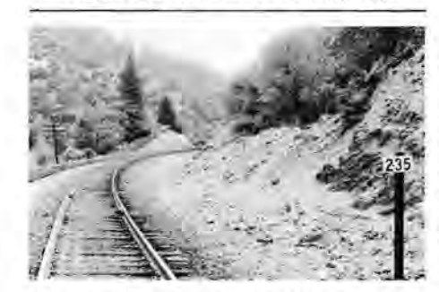
Milepost 235: near east end of the Poe siding.