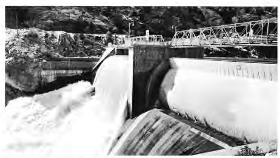
Cresta Dam on the Feather River near Western Pacific milepost number 247.