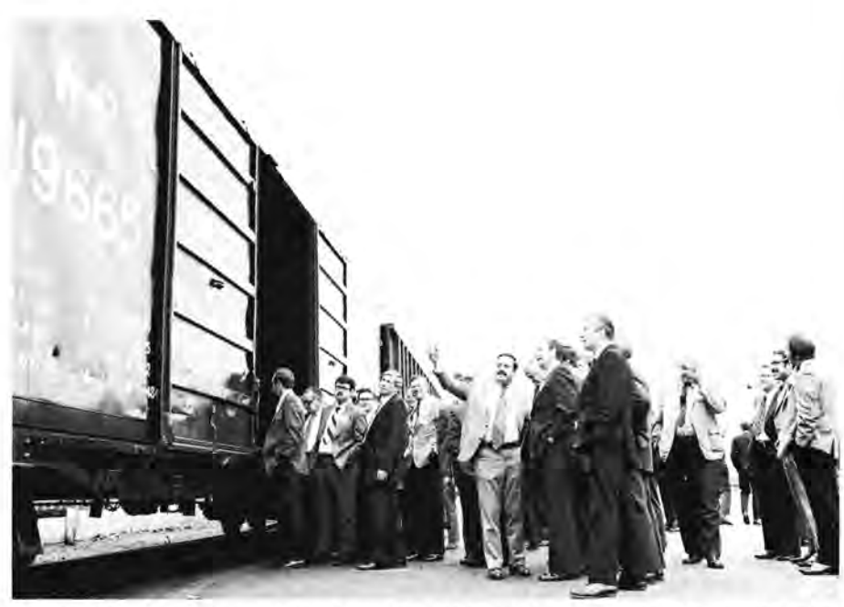
Western Pacific sales personnel from across the nation see first hand the W.P. railroad maintenance program during a tour of industrial properties and railroad facilities.

ing contribution by all—with no barriers of communication.