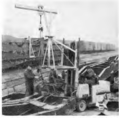
A swing boom jib crane was built for use with a fork lift truck to handle heavy items such as draft gears.

Deck boards, some cut to fit around side stake pockets, were precut and numbered, permitting easy assembly by matching identical numbers on the underframes.