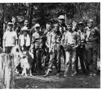
Portola Troop 47 on camping trip.

There are just too many names to permit listing all employees who take part in Scout activities between San Francisco and Salt Lake City, but their efforts are most appreciated and their services most valuable,