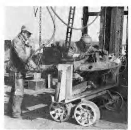
A truck side frame positioner was aid to welding.

placed right side up on their proper trucks and moved along a final assembly line for welding on lading strap anchors, application of decking, painting, stencilling, and a thorough final inspection before releasing for service.