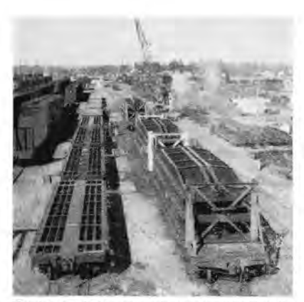
Nearly completed cars wait on assembly line for decking while new frames wait for unloading.

and transferred by crane to timber skids, where they remained in an upside-down position for the application of all underneath equipment. Using riveting only where essential, welding was used wherever possible in a position which would eliminate difficult overhead or vertical application. After spray painting, the underframes were turned over and