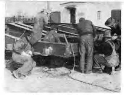
Welding parts to underframes.