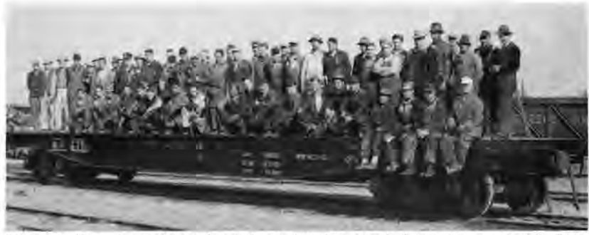
Western Pacific employees of the various crafts who helped to assemble the new cars pose for their picture as one of the first cars left the assembly line at the half-way mark.

The California Freight Special (CFS) will have a new eastern connection, leaving St. Louis at 1:30 a.m., five hours later than at present, and Kansas City at noon the following day, seven hous later than at present, but still arriving at Oakland at 4:00 p.m. on the fourth day and at San Francisco at 7:00 p.m. This is an improvement of five hours in transit time from St. Louis and seven hours faster from Kansas City.