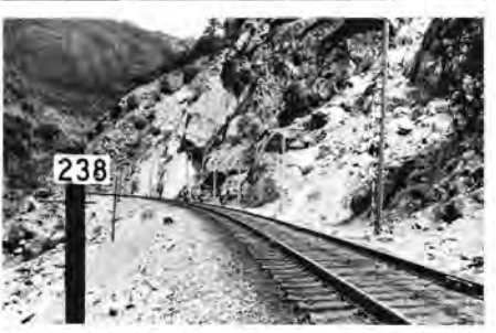
Milepost 238: located 1\frac{1}{2} miles west of Pulga and 3/10 mile east of tunnel #12.

WESTERN PACIFIC MILEPOSTS 526 Mission Street San Francisco, CA. 94105 Attn: Paul Gordenev