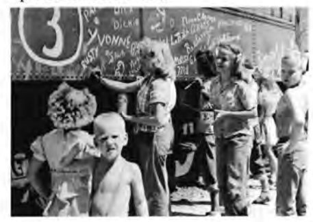
Part of the fun for kids at Winnemucca the day before was painting the sides of cars with names, faces and pictures. The result too, is a colorful train.

Kerak Shrine Temple of Reno picked up the nominal tab.