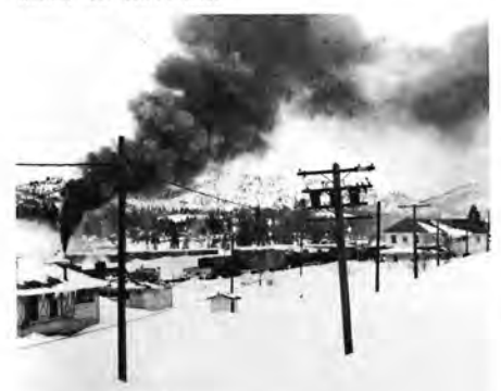
At Portola, where snowfall seldom exceeds three feet, the 1952 storm brought nine feet of the white powder snow.

As the storm abated, everything that could move snow, from rotary plows to shovels, worked in round-the-clock shifts to clear the way. Drifting snow blew back as fast as it was cleared, but eventually the forces of nature subsided and the men and women of Western Pacific got things back to normal.