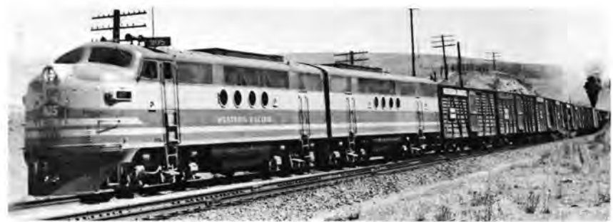
"Times—they were-a-changing...." as shown with EMD diesel #905 (built 1943) at Altamont in 1949. Note steam helper about 12

Five years down the line MILEPOSTS was proud to announce new "power to the Pacific." Dieselization was rapidly replacing steam on the Eastern Division. The route along the Feather River was completely diesel that month, too.