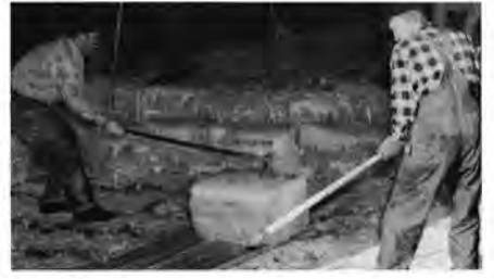
The 22 inch thick blocks weighed in at 250 pounds each. They were stored on end in the ice house until removed that next summer.

house was insulated and the ice acted as its own refrigerant until removed for icing refrigerator cars or shipped to WP's only other ice station at Portola.