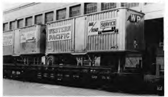
"Rail/Road service is on the way" was announced in the August, 1955 issue of Mileposts. "Insulated" trailers and specially equipped flat cars began service in this new field of transportation.

September 1, 1955 was the beginning of this revolutionary cooperative transport method on W.P. lines. In conjunction with the Great Northern and Santa Fe then, and with Rio Grande and U.P., today, "Piggyback"