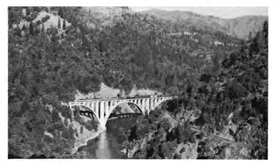
WP trains began operation over the 23 mile stretch of new main line on October 22, 1962. The North Fork Bridge over the Feather River

The permanent flooding of W.P.'s main line by the rising waters behind Oroville Dam necessitated mighty earthmoving and tunneling back in '62. A graceful concrete span over the North Fork of the Feather River and costs of about $40 million for relocation of the line were a major story then. Almost 13 years of work went into that project, made possible by the engineering talent of W.P.