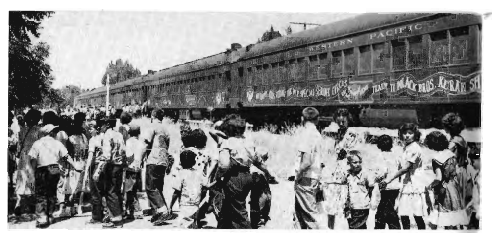
Part of the 1,060 happy kids who rode the WP special Shrine Circus train to Reno hold on to one of the guide ropes for the short walk to the stadium.

coach seats during their homeward journey. There was no calliope music now, which added much to the circus atmosphere during the morning trip, but there were hundreds of whips, half-eaten Cracker Jack boxes and other circus mementos tightly clasped in tiny fists waiting to be again put