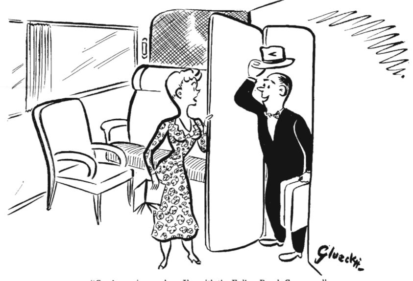
"Good morning, ma'am, I'm with the Fullup Brush Company."