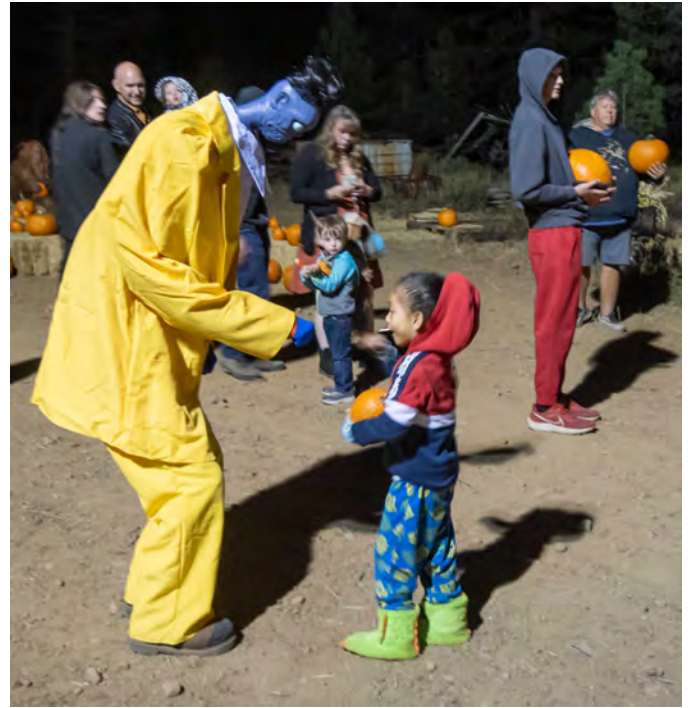
- Big Fish Creations