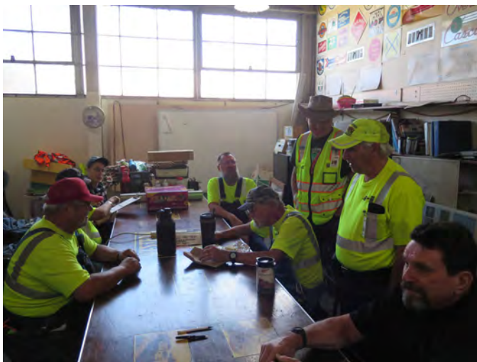
Open Cab Days - Docent meeting prior to open cab days.

Without the help of all the museum volunteers, we would not be able to keep the museum open and the caboose trains running each weekend. This also includes our special events, Pumpkin Express and Santa Trains .