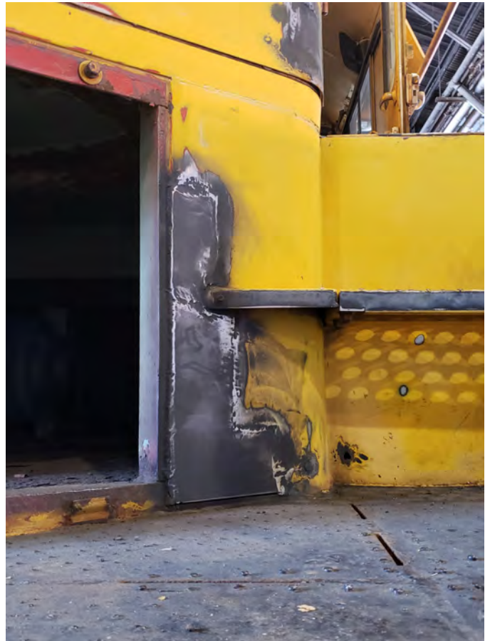
Cancer on the nose has been addressed.