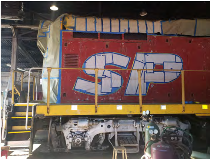
Masking for the red is almost finished on the long hood.

SP 2873 is awaiting warmer weather to finish the paint process. Primer has been applied to the roof, nose roof and sides to protect it for winter. Cancer on the nose and cab has been addressed also. It was decided to go further on the rust removal and primer after more cancer was found on the side of the nose above the battery boxes. Next spring the yellow on the cab, nose and frame will get applied with the red following. At that time the numbers on the cab will get a fresh coat of red. Then masking in preparation for the black on the steps and fuel tank will be applied. Last bit of work will be the silver on the trucks. As usual, a finish date will depend on weather and temperature.