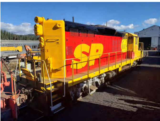
Not done yet, but looking good!