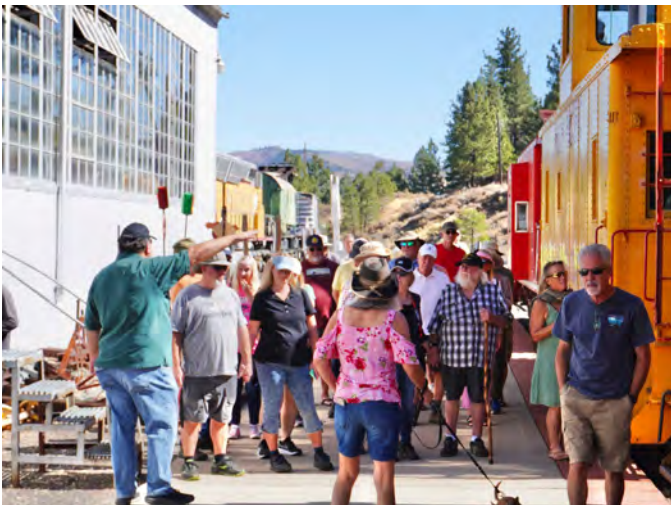
There was a really good crowd on RR Day 2024!