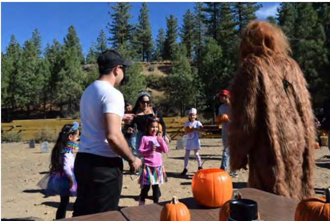
At the Pumpkin Patch