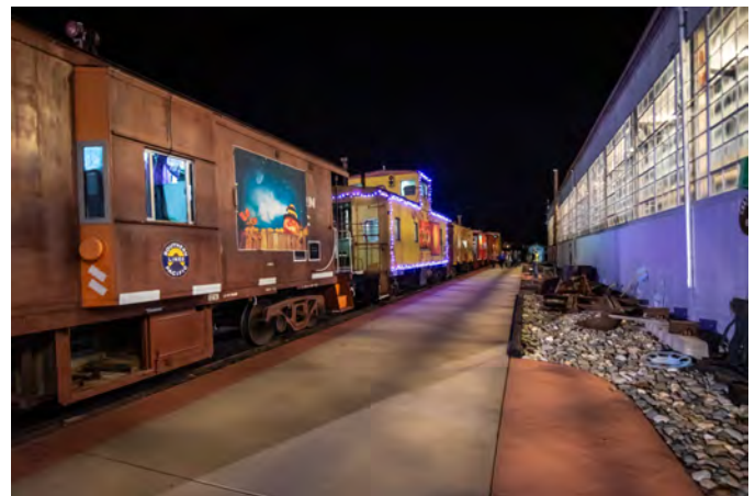
- Big Fish Creations