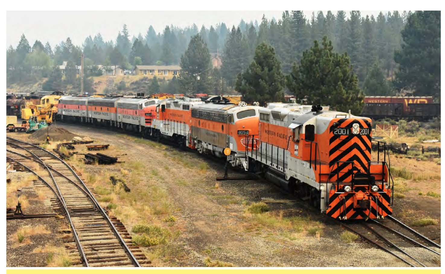
WP 165 needed to be moved to continue light bulb replacement in the shop. 2001 was used to pull it out and doing so allowed all six of the silver and orange diesels to be coupled up. 8/19/20

PRESORTED STANDARD U.S. POSTAGE PAID San Jose, CA PERMIT # 10