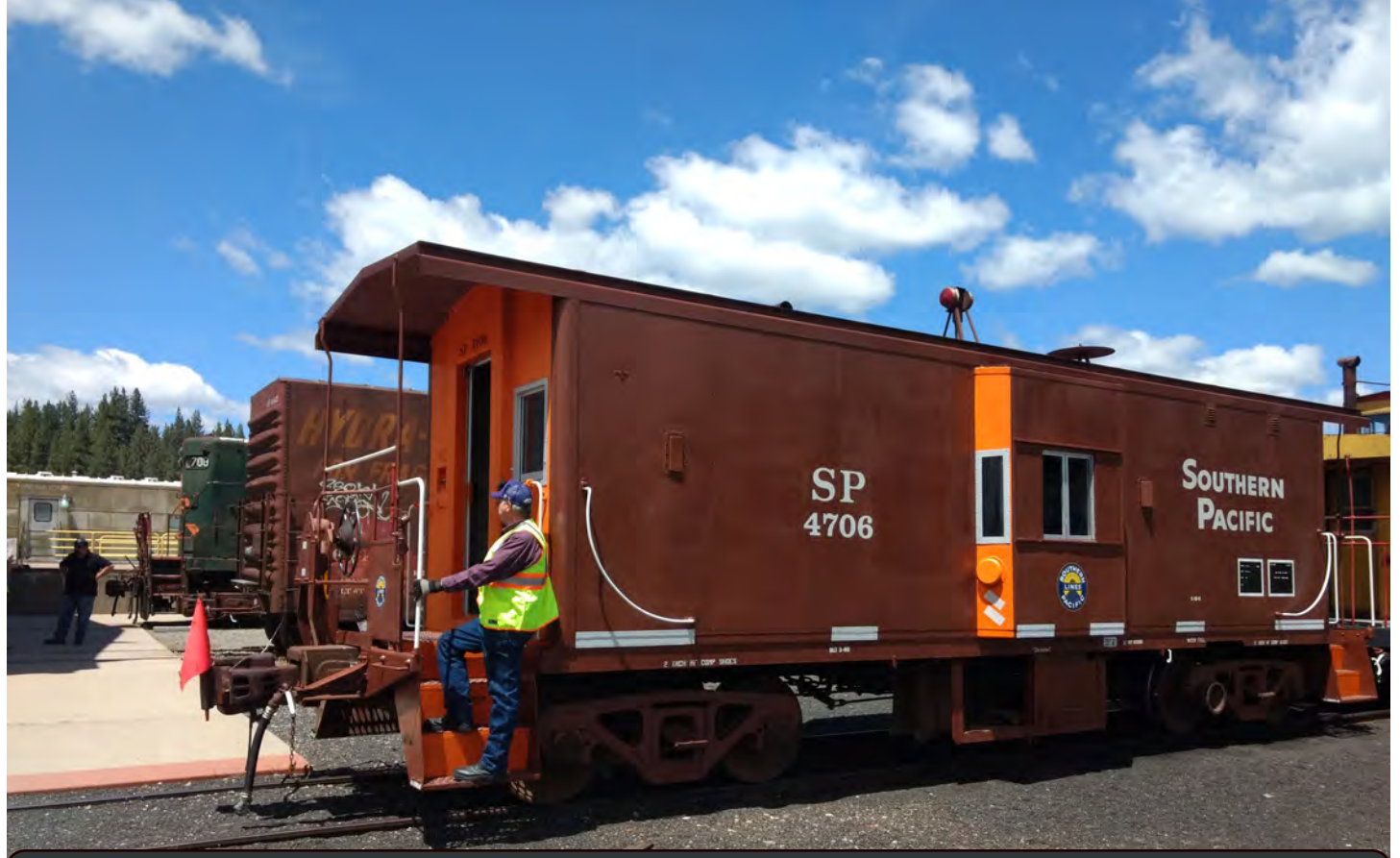
TOP: Kerry Cochran was conductor on 27 May 2018 for the caboose trains. He is seen here as the train backs into the loading platform after the 1:30pm run. The recently repainted SP 4706 continues to be a popular attraction on the caboose train.

BOTTOM: Bil "1L" Jackson sits in the QRR 1100 as Fireman between runs on 8 July 2018.