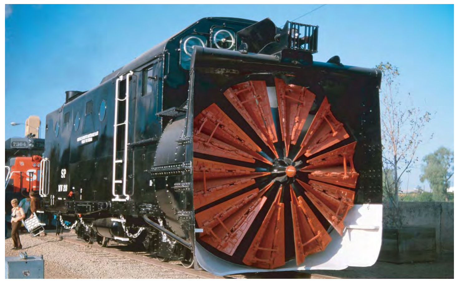
SP Rotary Plow MW208, now preserved at the WPRM, is shown here on display at the opening of the California State Railroad Museum. The date is May 21, 1981.

The Train Sheet Feather River Rail Society P.O. Box 608