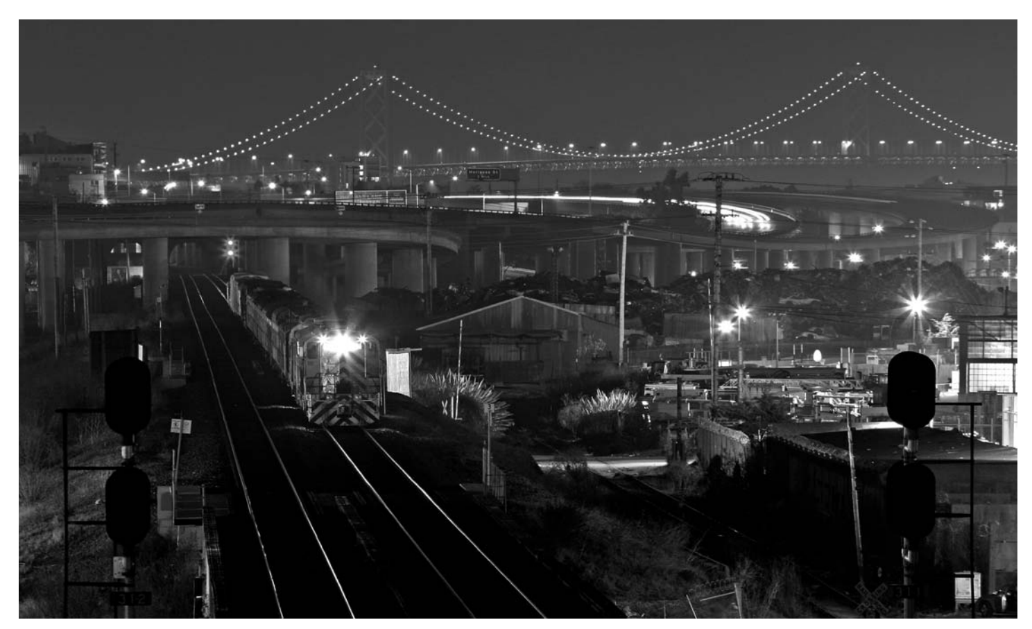
A spectacular view of WP 2001 ferrying GGRM equipment to Bayshore Yard with the Bay Bridge as a backdrop.