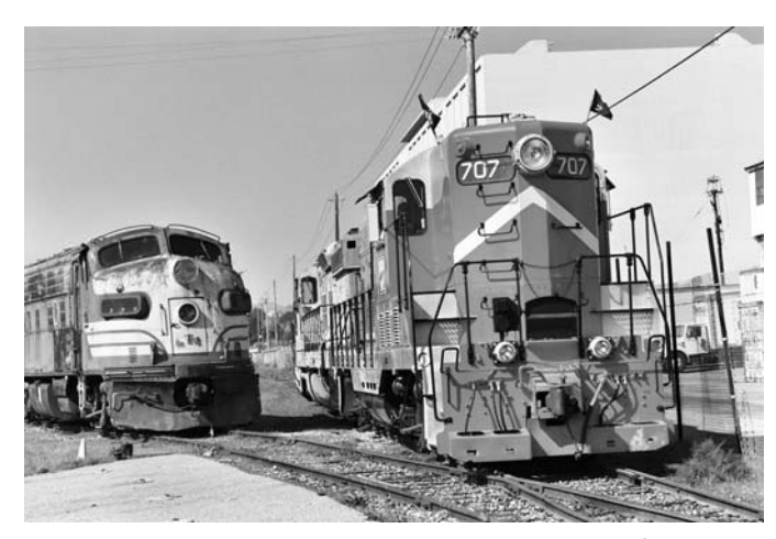
WP 707 switches the GGRM yard while a pair of ex-SP F7As waits on the next track.

Finally, there were the pieces GGRM was retaining, numbering in the dozens. Volunteers