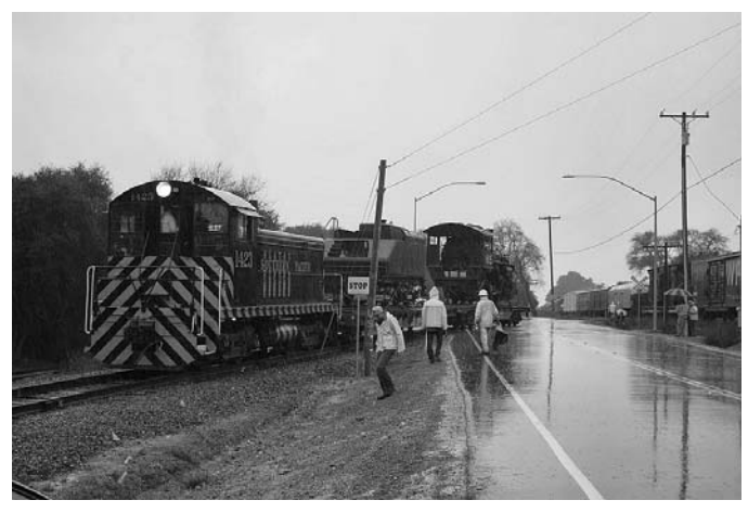
WP 165 is shoved onto the NCRy/UP interchange by PLA's SP 1423. She will be coupled into the train and soon complete her journey home.

This was a once in a lifetime move that went flawlessly and safely. Three organizations worked together in a tremendous show of cooperation to make this happen, helping out a friend in need. Huge thanks to all the FRRS personnel that helped make this possible, and to all the GGRM and PLA personnel who worked to make this event successful and safe.