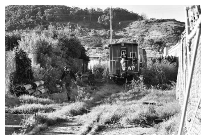
WP 484 leads the way during a shove down the weedcovered and twisting Hunter's Point spur.

By the third week in February, the end was in sight. Most of the equipment had been inspected and cleared for travel. Moving out of Hunter's Point would be as large a task as getting everything ready in the first place. The line connecting the museum to the outside world is a twisting industrial spur that wanders between buildings astride soggy and well worn ties. There was no way the entire train, which would eventually number 37 cars and locomotives, could be moved in one shot. On February 23, the first cut rolled out the main gate, as WP 707 took SP 4450, two SP F7As, the triple unit diner and an ex-SP articulated double unit coach out to the CalTrain mainline.