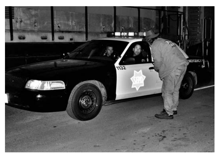
Vic Neves gives a rundown of the night's events to a pair of SF police officers as the special train waits for clearance to enter the CalTrain mainline.

The last cut departed GGRM at 10:45 PM, with WP caboose 484 leading the way through the back alleys and on to Carroll Street. Stopping just short of Third Street and the CalTrain connection, the crew settled in to wait for the last commute plug and clearance to occupy the main. Locals and passersby were amazed at the sight of the long train standing in the middle of the street, taking up nearly the entire length of the street trackage. Members of San Francisco's finest stopped by, enjoying the unusual break in their regular beat, while a small army of local railfans snapped shots and found choice locations to record the event.