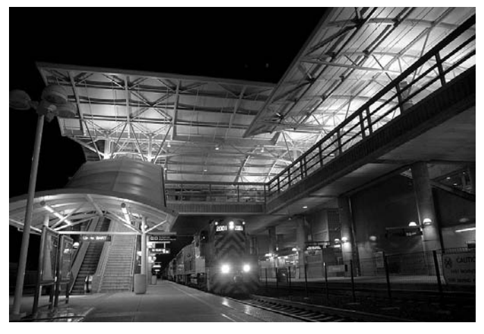
Rolling through the Millbrae CalTrain/BART depot.

equipped cars in the consist. Gail McClure and Eugene Vicknair acted as the ground support crew, rolling the train by at various stops, including the recently opened Millbrae CalTrain/BART depot. The combination of orange and silver power, early 20th century passenger cars and 21st century transit architecture created a truly surreal moment.