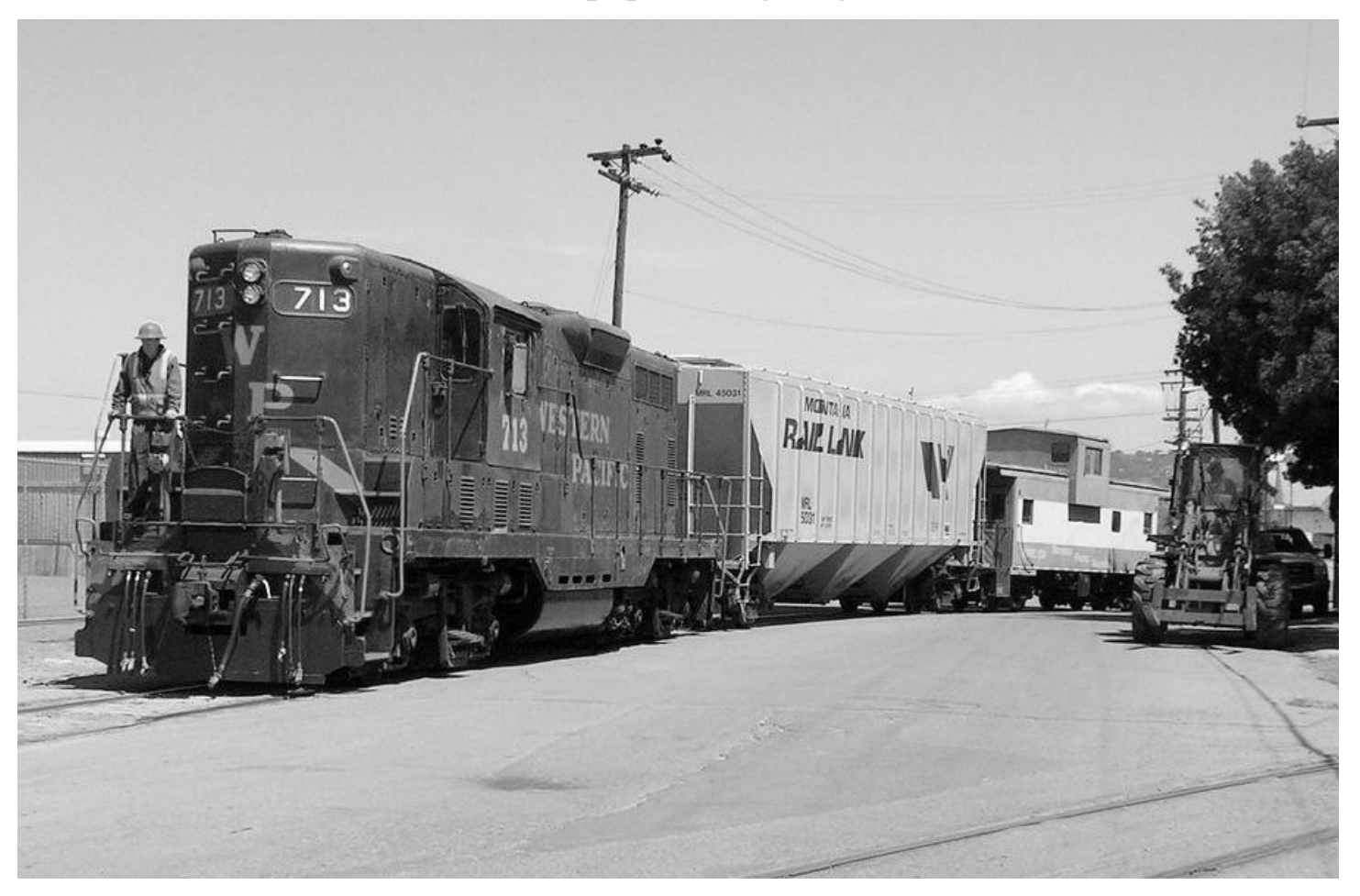
WP 713 works on the Richmond Pacific crossing Wright Street in Richmond CA.