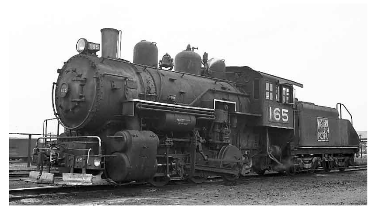
0-6-0 switching locomotive, built Alco-Schenectady, 1919