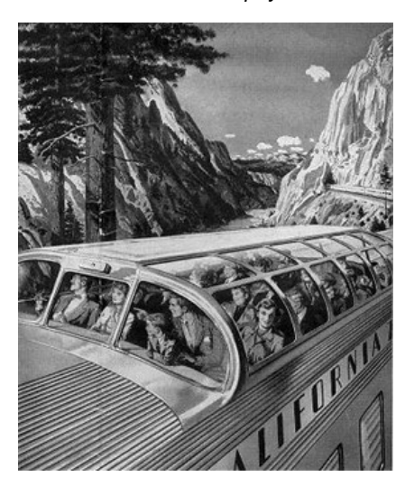
Domes were the icons of the California Zephyr.