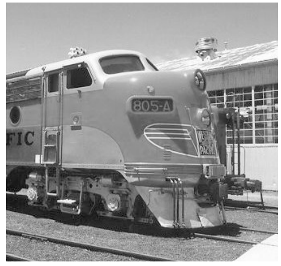
The 805A as it appears today in Portola.