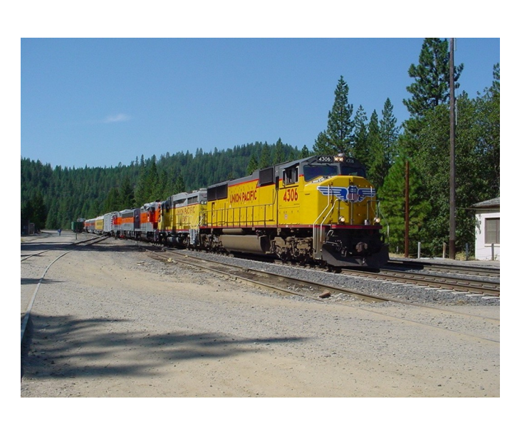
Waiting patiently at Keddie for a westbound stack train.