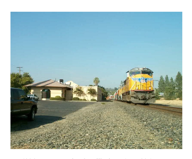
UP 4306 West stopped at Oroville depot (M.P. 205)

ISSUE 115