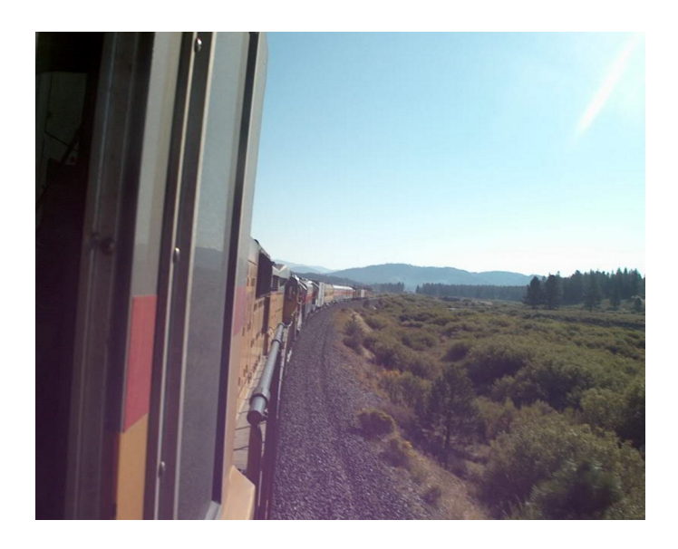
View of our train looking back from the head end.