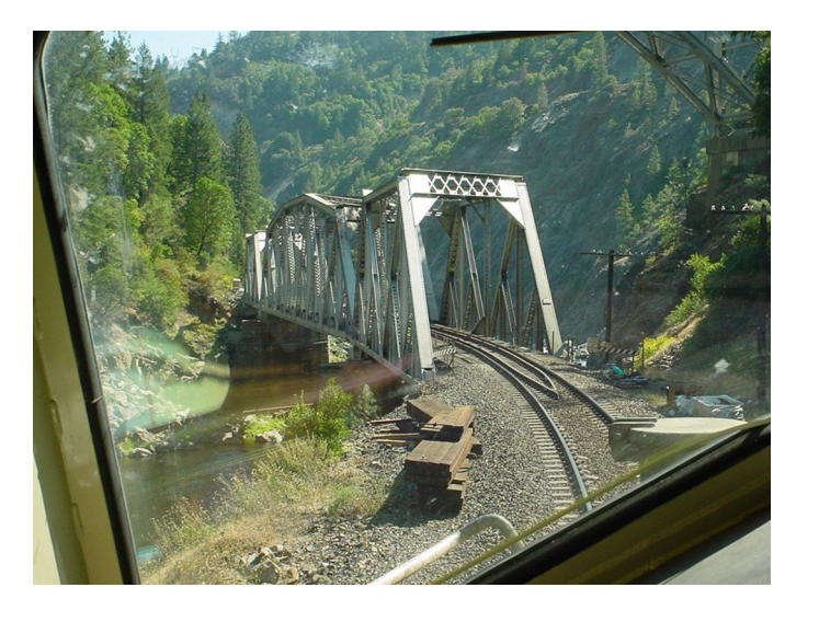
Three span through truss bridge west of Pulga.