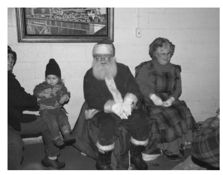
Santa and Mrs. Claus are always a big attraction during the Santa Train Festivities.

As a reminder my email address is brimmer@wwdb.org and I thank all of you in advance for volunteering your time to assist with this event.