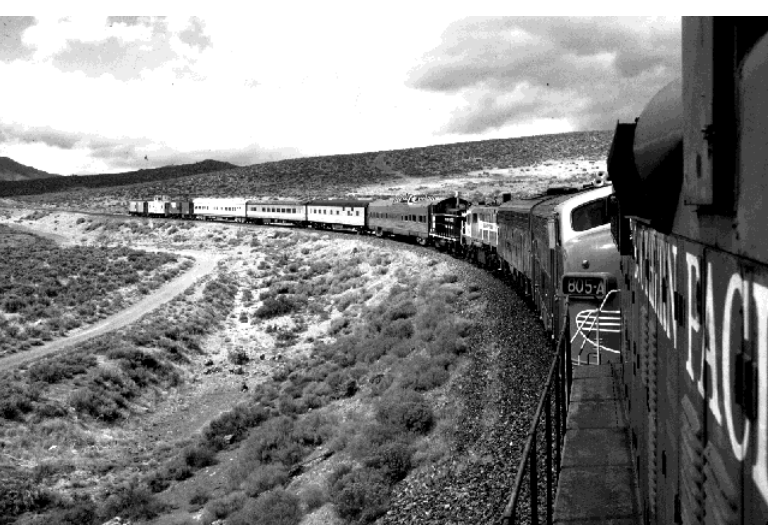
An impressive and colorful train, our movement of equipment recieved many second looks from all who witnessed it.

Next time: The movement of the train to Truckee, setup, Railroad Days and coming home. Stay tuned.