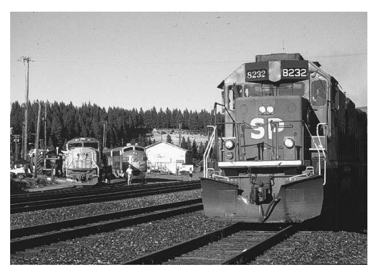
Helpers on the "Hill" are still needed as evidenced here with a set of ex SP locomotives departing the yard westbound after assisting an eastbound manifest up the grade. Activity was all around as we prepared our equipment for display.

To preserve and interpret the history of the WP, the "Willing People" as a vital link in the development of the rail industry on the West Coast, including the steam and diesel evolution, WP's influence in the passenger tourism industry, the impact of freight competition between neighboring railroads. WP's influence in the lumber, mining and agriculture industry from Plumas County throughout California, Nevada and Utah