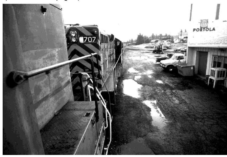
Looking from trailing unit 4404 WP 707 East pulls past the Portola Yard Office towards the main and Reno.