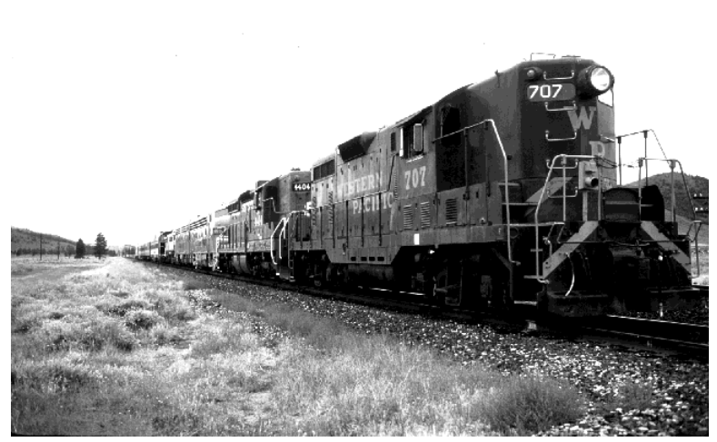
Taking the siding at Hawley allowed for inspection of the train to ensure the well being of our equipment during the move.

Twisting and turning down the branch, the view from the back of the "Train of Odyssey" towards the head end was to say the least, unique. WP & SP locomotives, fully blue carded, were operating on a class one railroad after being off the main line for fifteen to twenty years. The train slipped past Panther Valley and Parr yard, wound its way through the University of Nevada, Reno campus and finally past the old but