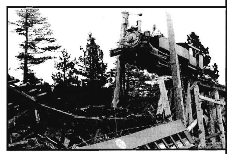
California Fruit Exchange 2-6-2ST #1 had her nose smashed in on an unknown date while working for the company out of Graeagle. This locomotive is now heading for operational restoration in Fort Bragg, California.

While no news is sometimes good news, we have no news to report on the proposed restoration of our SP 0-6-0 No. 1215. We have not progressed any further than the desire to having it running someday. Our resident volunteers have so much work just to keep the facility open and taking care of all the details associated with our museum we cannot take on a major restoration project. We are looking for someone or a group that would like to see the engine operate, to take on the task.