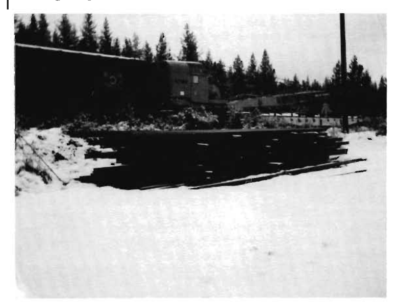
Two truck loads of rail from Grays Flat, consisting of 108 pieces of rail, and weighing 55 tons, are stacked inside the balloon track for use on possible track extensions at the Museum. Some rail dates from 1907 when WP was built.

All FRRS members in good standing receive a 10% discount on all items purchased in person or by mail from the FRRS Gift Shop. You must ask for this discount when making the purchase.