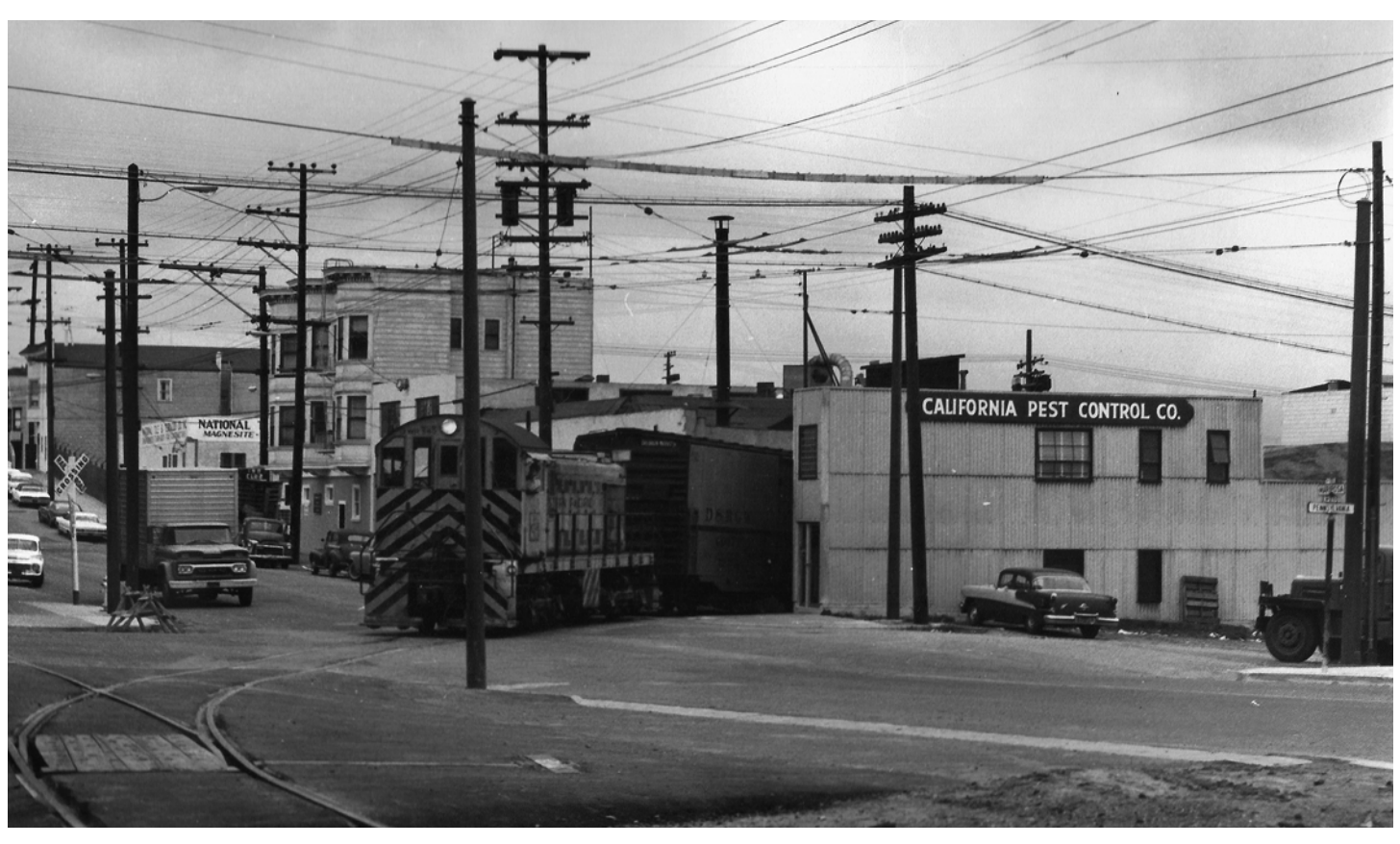
FROM THE PAST - A WP Alco S2 pulls a cut of cars across Mariposa Street in San Francisco. The train is leaving joint Southern Pacific - Santa Fe rails and about to roll onto Santa Fe tracks. This is all part of the trackage rights WP obtained in 1962 to bypass burned out Tunnel A.

PRSRT STD U.S. Postage PAID Permit No. 580 Manhattan, KS 66502