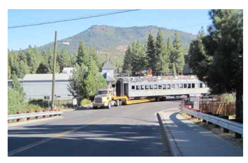
Taking the turn from Commercial Street onto the Gulling Street bridge, one of the subs is just minutes into its journey.

A good overview of just how complicated this could get. As WP derrick MW37 lifts, the backhoe is in place to pull the now released truckset. WP NW2u 608, in the background, pulled the first truckset to allow the lead trailer (the yellow visible under the far end of the car) to be backed into place. The following trailer, in the foreground, will be moved as soon as the truck is away. The big white forklift holds welding gear and other tools at the ready.