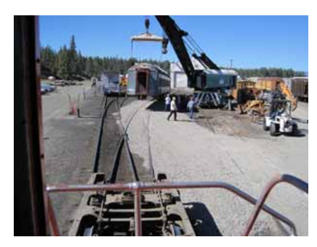
With one end in the air, the crew is ready for the lead trailer to be backed into place. The sub's truck is visible in the foreground through WP 608's handrails.

Even with all the big machines, brute strength is sometimes needed. One of the trailer dollies is moved into position.