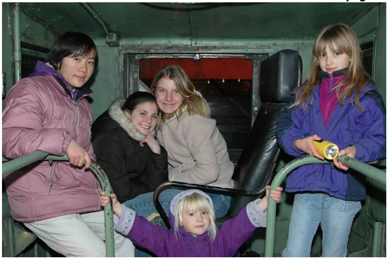
Girls love trains, too. A group of happy riders at the museum.