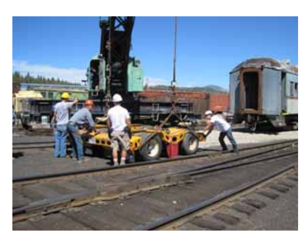
The crew confers on how to best position one of the trailer dollies. These trailers were positioned under the rear end of each car and allowed these long loads to be handled.

As reported in the previous issue, the former Southern Pacific suburban passenger cars stored at the museum for many years were acquired by the Timber Heritage Association for use in the Eureka area. The loading of these cars was one of the more complicated operations done at the museum in recent years. Here are more photos of this massive operation courtesy of Norman Holmes.