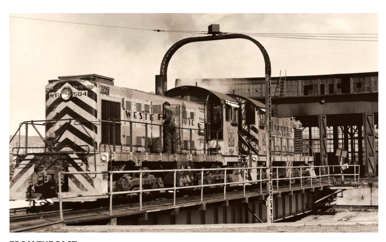
FROM THE PAST - WP Alco switchers 504 and 555 take a spin on the turntable. Today, WP 504 is in the collection of the WPRM.

PRSRT STD U.S. Postage PAID Permit No. 580 Manhattan, KS 66502