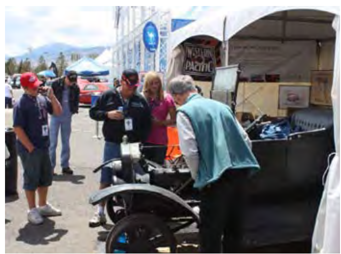
HAN visitors checking out our Model "T" railcar.