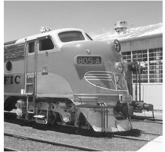
The 805A as it appears today in Portola.

Please send all CZ donations to: The Zephyr Project P.O. Box 608 Portola, CA 96122-0608