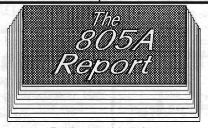
By Larry Hanlon

mounting frame. These parts were cleaned up and installed, along with two 1-1/2" radiator hoses to complete the crankcase purge connection from the breather to the engine air blowers. (The radiator hoses are a temporary solu-