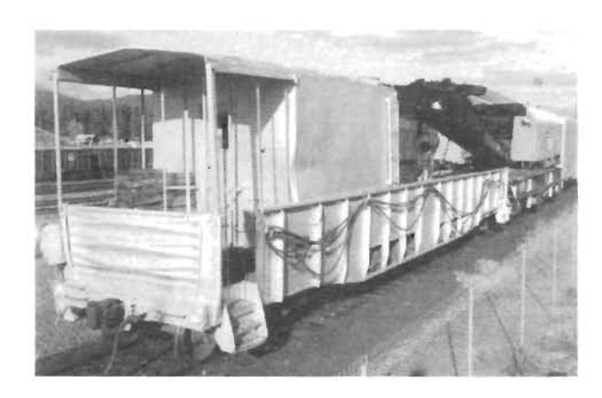
Boom car 37-1, which came with derrick No. 37, was converted from a WP 6550 series gondola car.

Raffle tickets are $3 each or 5 for $10. All proceeds go to the Feather River Rail Society and the Portola Railroad Museum. We want to congratulate Louise Reith of Tahoe City, who won the two free tickets last September 15. Support your railroad museum, buy these raffle tickets.