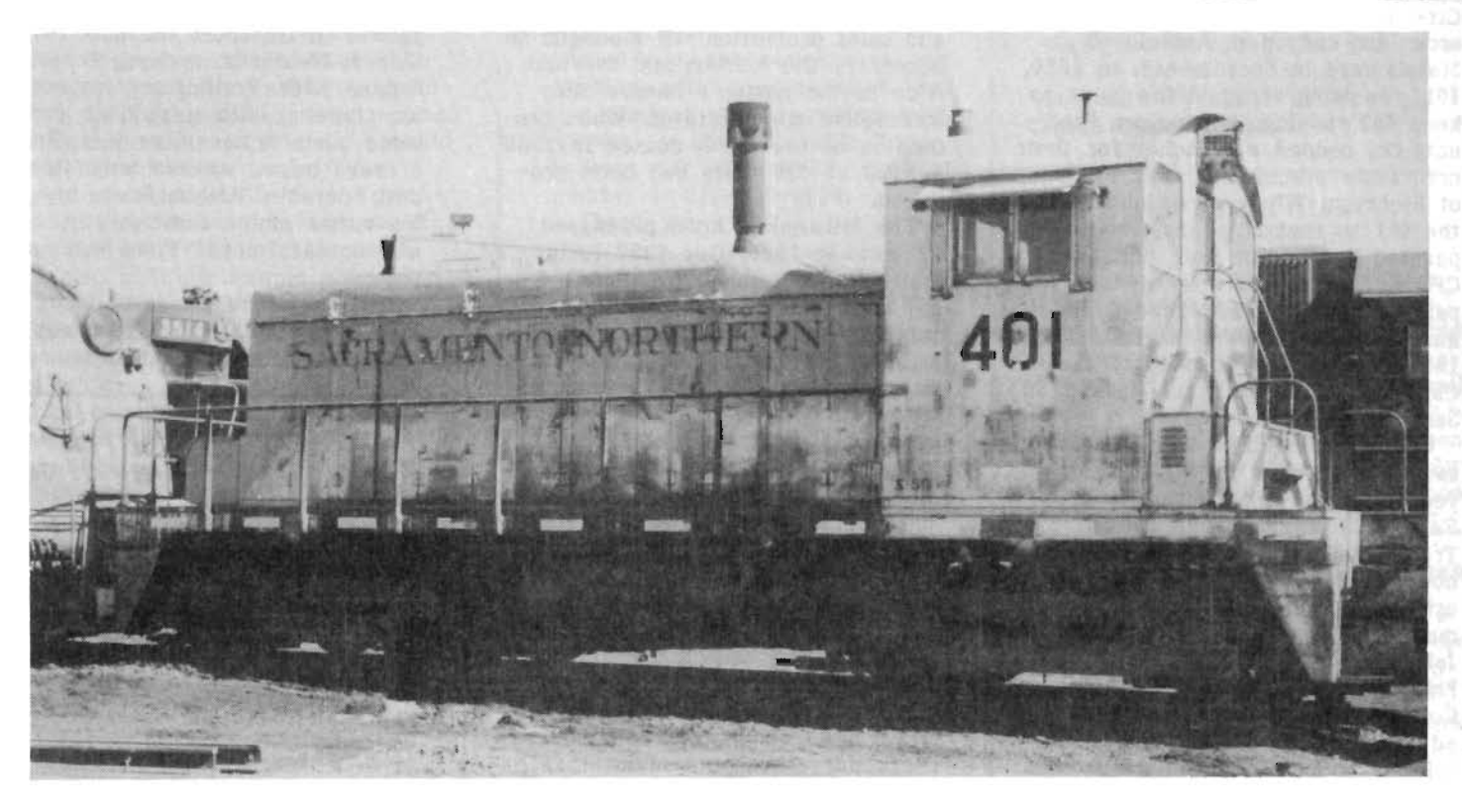
Western Pacific's first diesel sitting on the garden tracks at Stockton nosed up to the 921!