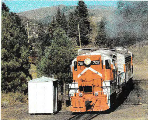
Railfan Day 2002—Photo by Scott Chandler