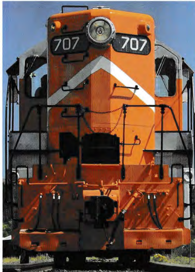
Open for more information