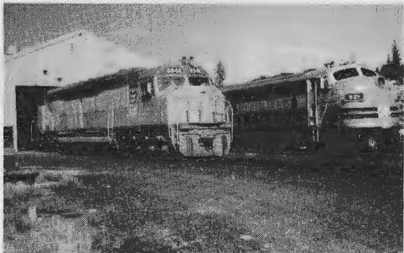
UPDDA-40X, 6946, WPF-7A, 921 along with the last Zephyr locomotive WP 805-A are at the museum site.

With over 20 diesels the Society has one of the largest collections of preserved diesels and over 50 pieces of freight equipment and every style of WP caboose from wood to steel. All undergoing restoration to correct paint schemes.