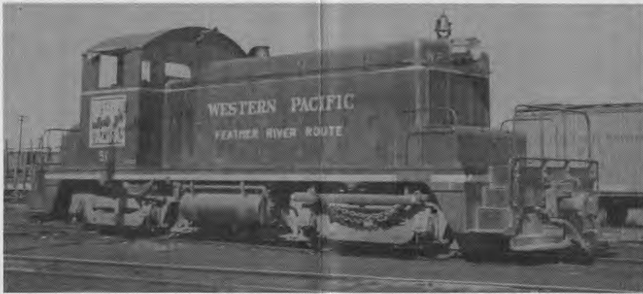
Preserved in Portola is the WP 501 and EMD SW-1 built in 1939 which was the first diesel on the Western Pacific.

The FEATHER RIVER RAIL SOCIETY , a tax exempt California Corporation, operates the PORTOLA RAILROAD MUSEUM at Portola, California. Formed in February, 1983, to establish a railroad museum in Portola with the purpose of preserving local railroad history in general and Western Pacific Railroad history in particular. As a Society we are involved with restoration and collection of railroad equipment, photos, artifacts, historical information and data.