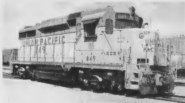
Union Pacific 6P-30 is one diesel at Portola.

All members receive the official publication of the society, "THE TRAIN SHEET" bi-monthly. Packed with museum news, activities, upcoming events, projects and articles on the WP and its equipment, with data, drawings and photos, plus railroad stories. Every third weekend each month members meet together and work on museum projects.