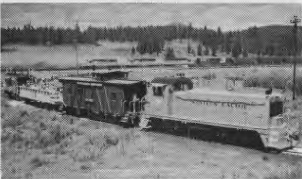
"Come ride in a caboose"

We have leased the former Western Pacific diesel shop building and adjacent track area in Portola from the Union Pacific through the City of Portola for our museum site. The 37 acres included in the lease has about 12,000 feet of track including a balloon track for turning equipment and a 16,000 sq. ft. shop building with two tracks running the 220 foot length. A repair and restoration shop facility, library, office and meeting rooms will be included within the structure. Other property improvements include a replica W.P. passenger depot, freight depot for a future model railroad layout, section house, water tank and a picnic and park area.