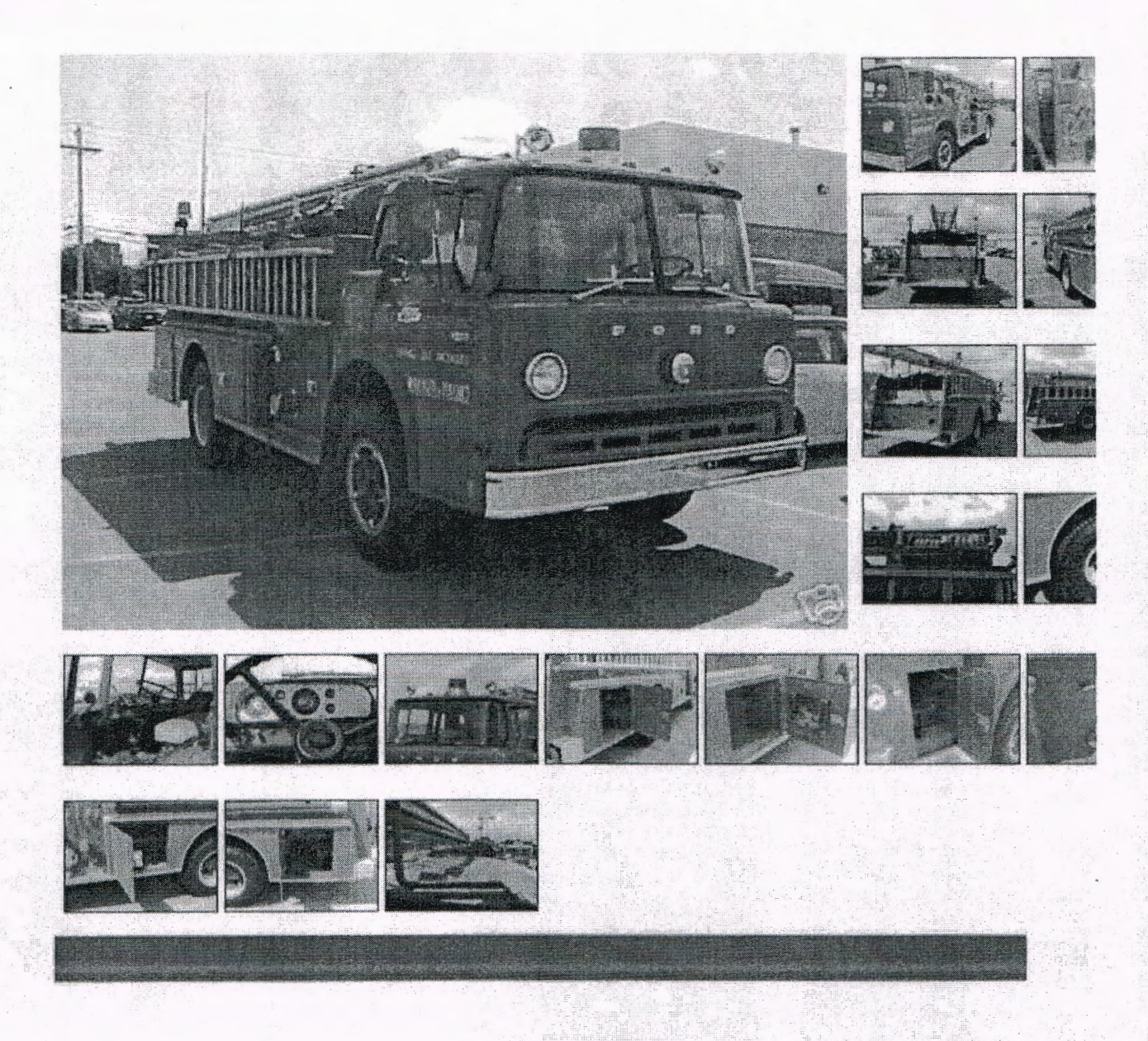
00644 Learn about eBay counters