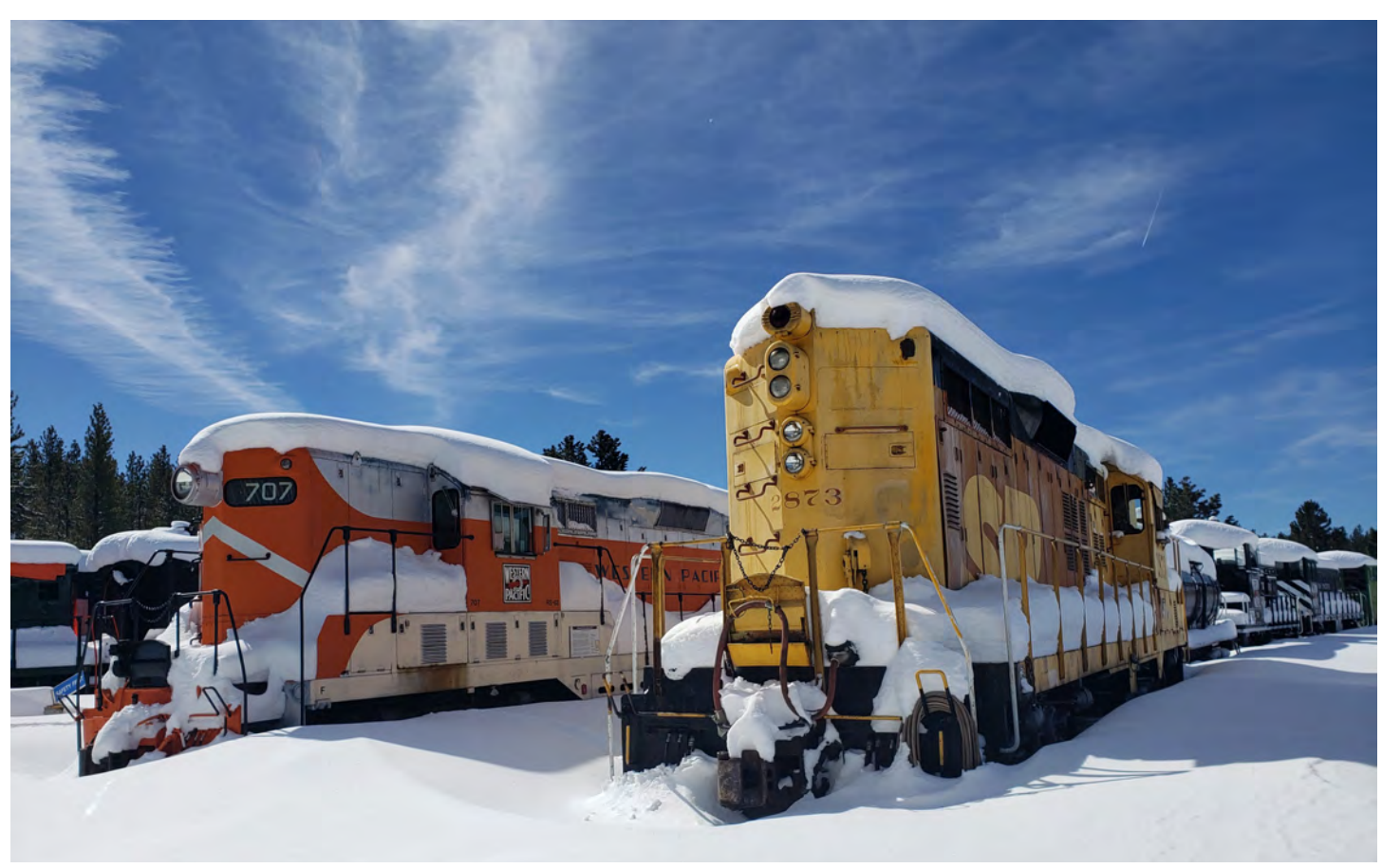
WP 707 and SP 2873 rest under a blanket of snow between storms at the museum on March 2, 2023.

PRESORTED STANDARD U.S. POSTAGE PAID San Jose, CA PERMIT # 10