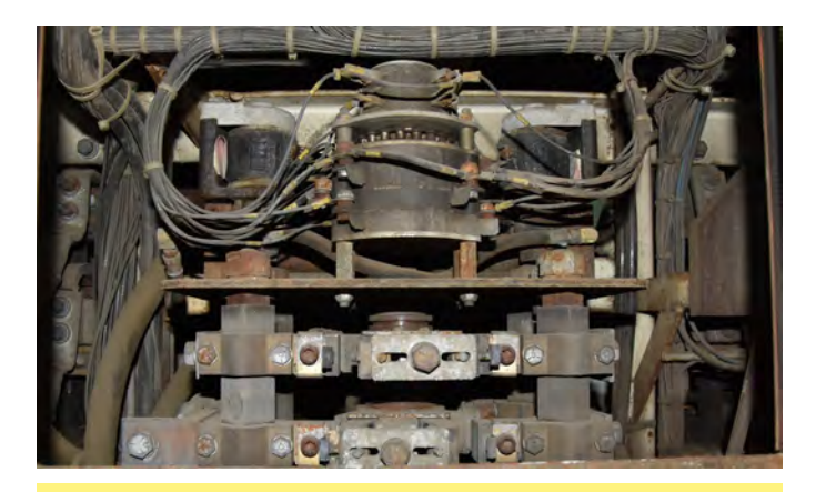
Cam switch contactor for the traction motors from SP 2873. That is what you hear clicking when you go from power to dynamic brakes. Additional SP 2873 electrical photos are available online at WPLives.org/trainsheet192.

to be used in a traction motor circuit, it will be called upon to pass very heavy currents and it is important that the contactor contacts are pressed together very tightly. For this reason, pneumatic contactors are used.