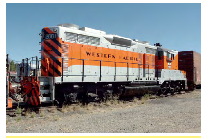
EMD GP20 -WP 2001

More photos of the WP 55069 move are shown on the society's web page (www.WPLives.org) in the WPRM Photo & Video Gallery on the "About Us" pull-down menu.