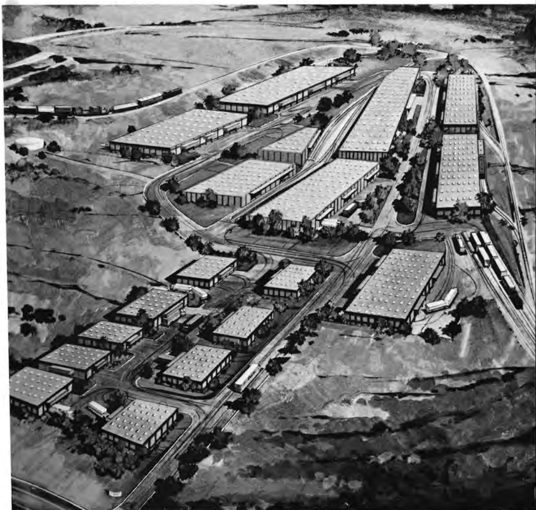
Parr-Reno Distribution Center