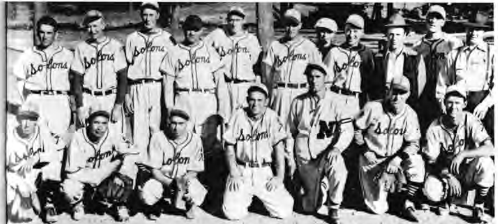
PORTOLA BALL CLUB Apr. 29, 1945