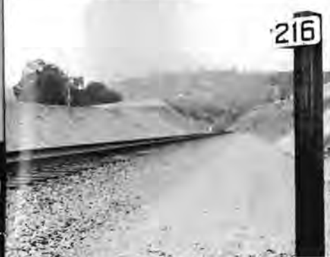
Milepost No. 216: Rimrose in the distance, as line sweeps around Table Mountain.