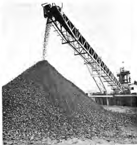
Stockpiling crushed ore at Big Mike

have a stockpile in excess of 600,000 tons of low-grade oxide ore which they are endeavoring to market.