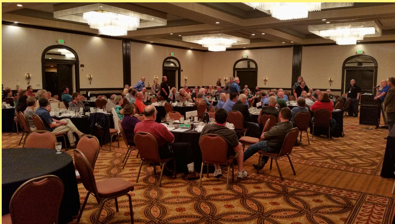
The Closing Banquet of the 2016 Convention.