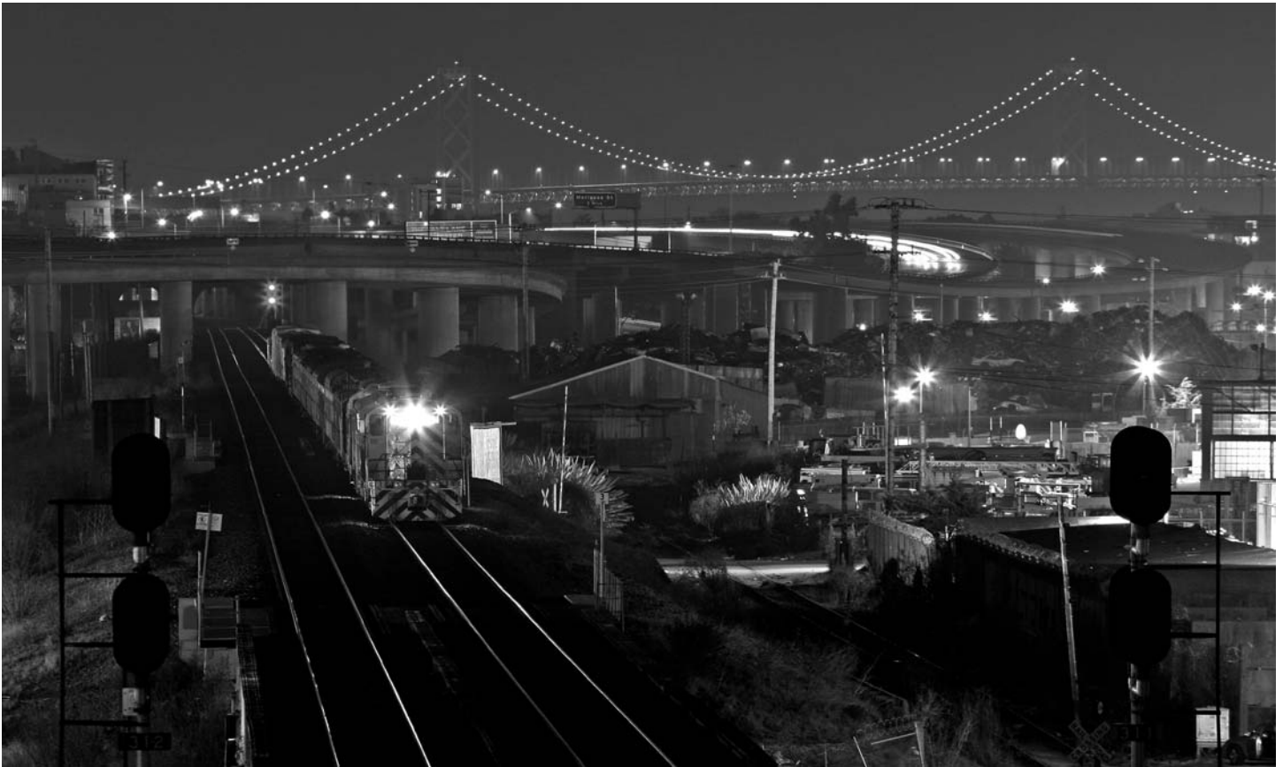
A spectacular view of WP 2001 ferrying GGRM equipment to Bayshore Yard with the Bay Bridge as a backdrop.