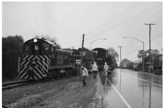
WP 165 is shoved onto the NCRy/UP interchange by PLA's SP 1423. She will be coupled into the train and soon complete her journey home.

This was a once in a lifetime move that went flawlessly and safely. Three organizations worked together in a tremendous show of cooperation to make this happen, helping out a friend in need. Huge thanks to all the FRRS personnel that helped make this possible, and to all the GGRM and PLA personnel who worked to make this event successful and safe.