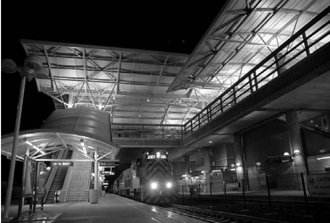
Rolling through the Millbrae CalTrain/BART depot.

equipped cars in the consist. Gail McClure and Eugene Vicknair acted as the ground support crew, rolling the train by at various stops, including the recently opened Millbrae CalTrain/BART depot. The combination of orange and silver power, early 20th century passenger cars and 21st century transit architecture created a truly surreal moment.