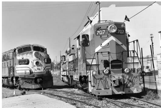
WP 707 switches the GGRM yard while a pair of ex-SP F7As waits on the next track.

Finally, there were the pieces GGRM was retaining, numbering in the dozens. Volunteers