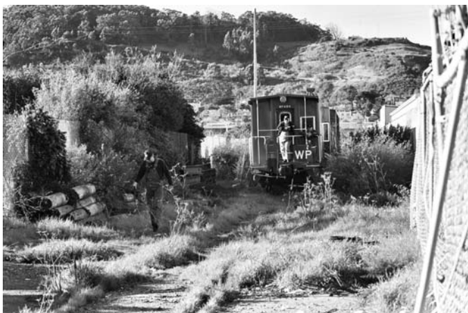
WP 484 leads the way during a shove down the weed-covered and twisting Hunter's Point spur.

By the third week in February, the end was in sight. Most of the equipment had been inspected and cleared for travel. Moving out of Hunter's Point would be as large a task as getting everything ready in the first place. The line connecting the museum to the outside world is a twisting industrial spur that wanders between buildings astride soggy and well worn ties. There was no way the entire train, which would eventually number 37 cars and locomotives, could be moved in one shot. On February 23, the first cut rolled out the main gate, as WP 707 took SP 4450, two SP F7As, the triple unit diner and an ex-SP articulated double unit coach out to the CalTrain mainline.