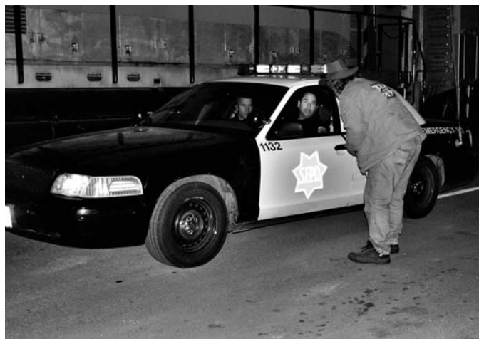
Vic Neves gives a rundown of the night's events to a pair of SF police officers as the special train waits for clearance to enter the CalTrain mainline.

The last cut departed GGRM at 10:45 PM, with WP caboose 484 leading the way through the back alleys and on to Carroll Street. Stopping just short of Third Street and the CalTrain connection, the crew settled in to wait for the last commute plug and clearance to occupy the main. Locals and passersby were amazed at the sight of the long train standing in the middle of the street, taking up nearly the entire length of the street trackage. Members of San Francisco's finest stopped by, enjoying the unusual break in their regular beat, while a small army of local railfans snapped shots and found choice locations to record the event.