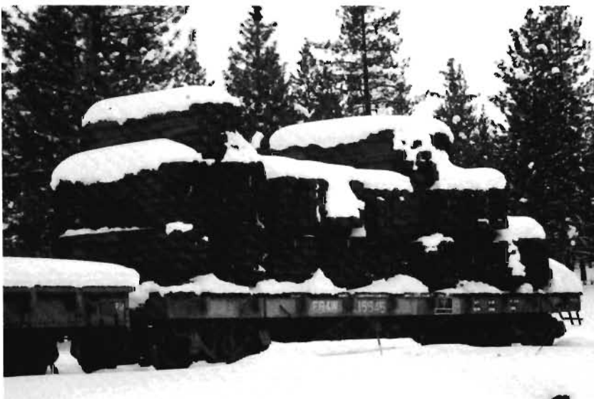
Left: Our flat car FR&W 15545 now has 500 ties on it for use on possible future track extensions at the Museum. These were acquired from government surplus at the Sierra Army Depot at Herlong, CA.