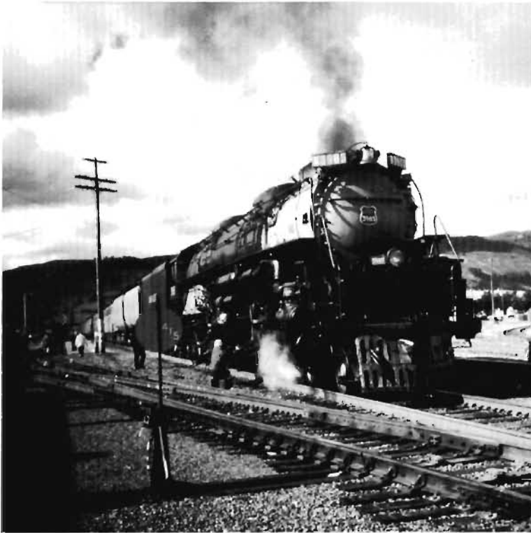
Left: Union Pacific steam locomotive 3985, a 4-6-6-4 Challenger, is shown on the point of a Pacific Limited Excursion train at La Grande, Oregon on October 4, 1995 on a service stop. The FRRS is a member of the Pacific Limited Group.