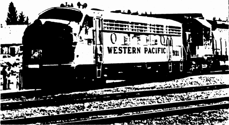
WP F-7A No. 921 and UP SD-40-2 Portola August 28, 1983