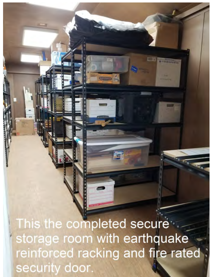
This the completed secure storage room with earthquake reinforced racking and fire rated security door.